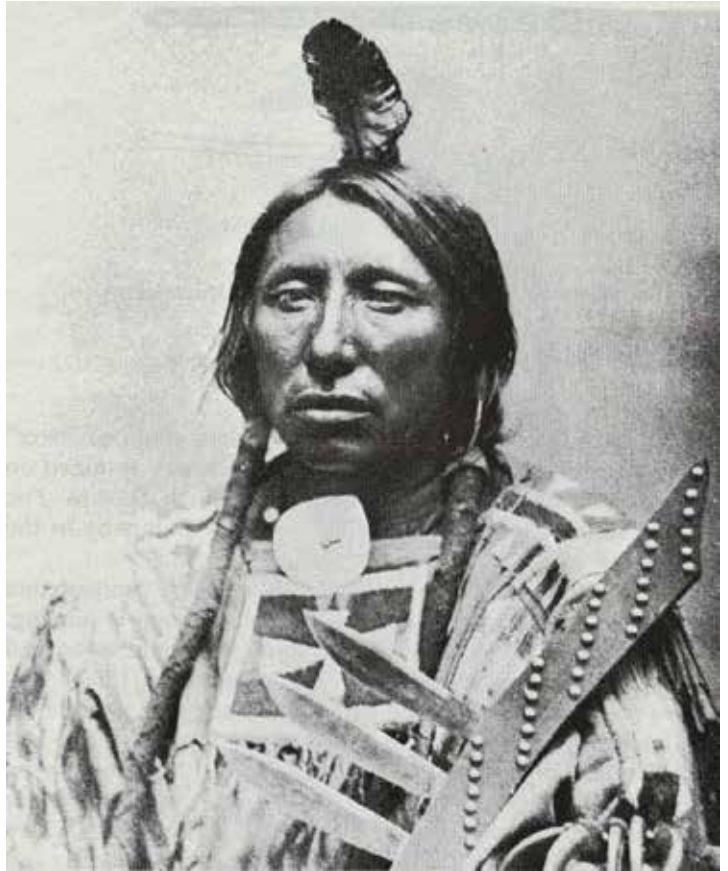
1880 Photo of Spotted Eagle with a knife club