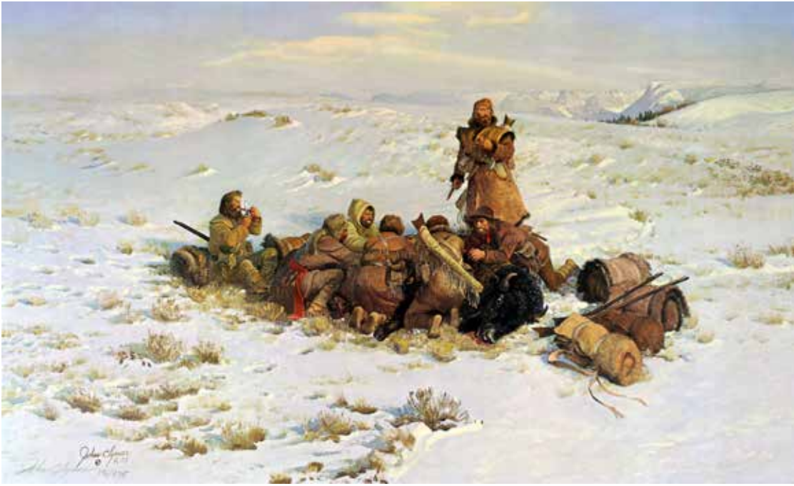
“SURVIVAL” (Frame not Shown) 15 in. x 25 in. Image Museum Quality Print Double Signed 196 of 975

Robert Stuart and his men set out from Fort Astoria on the Pacific coast, in 1812, bound for St. Louis. Plagued with hard luck, they were attacked by Indians, and their horses and supplies were stolen. They continued on foot in a vast, unknown country.