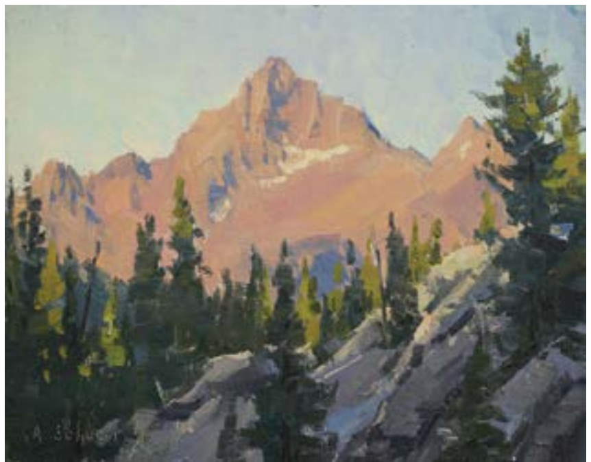
“PILOT PEAK” (Frame not shown) 9.25 in. x 11.25 in. 8 in. x 10 in. Image Original Oil on Canvas