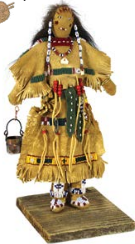
CHEYENNE INDIAN DOLL 13 in. x 7 in. Original Work