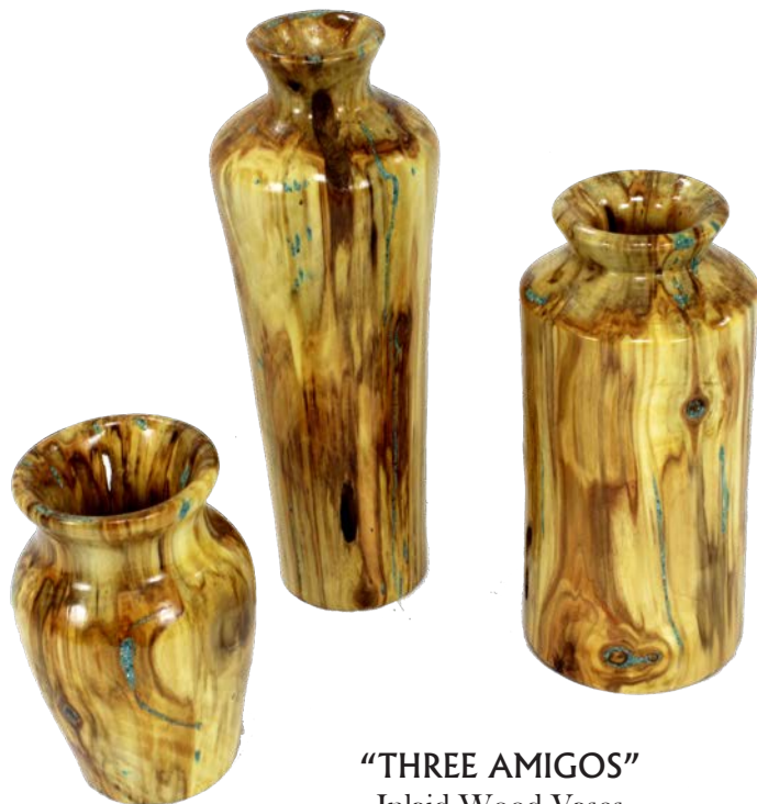
"THREE AMIGOS" Inlaid Wood Vases Aspen with Turquoise Inlay 11.5 in. x 4 in, 9 in. x 4 in, 6 in. x 4 in.