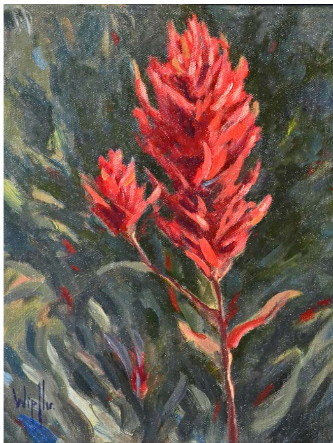
"PAINTED PAINTBRUSH" 11.5 in. x 9.5 in. (Frame not shown) 10 in. x 8 in. Image Original Oil on Canvas