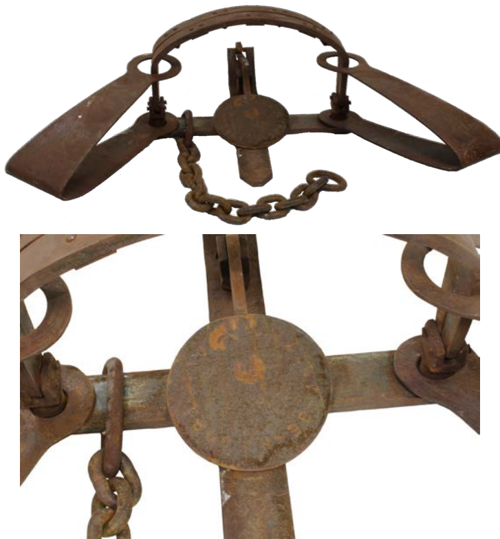
"REPLICA METAL #6 BEAR TRAP" 44 in. x 19 in. x 11 in, Weight 40 lbs.