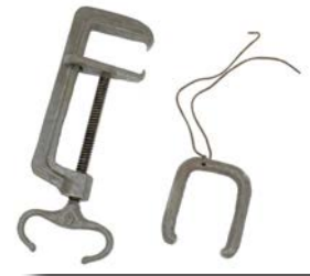
Trap Setting Tools Clamp 10.5 in. x 4 in. Holder 4 in. x 3 in.

A replicated Model 6, S Newhouse Grizzly Bear Trap. Hand crafted from wood, mostly oak and cherry. One of a kind. This is a replica of an actual 19th-century trap from the Museum of the Mountain Man collection. For display. Can be wall-mounted. The setting tools are wood replicas of original Newhouse #6 tools in the collection of the Trap History Museum, Galloway, Ohio.