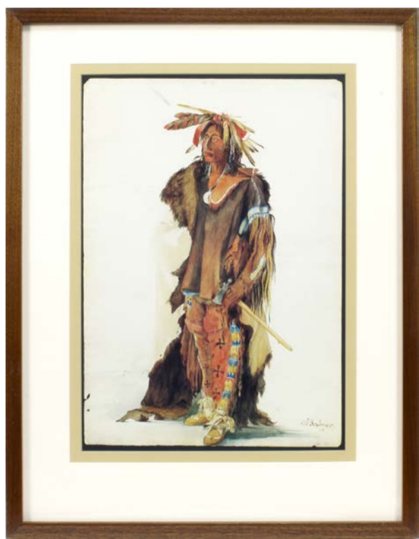
"YANKTON SIOUX CHIEF WAHKTÄGELI"

24 in. x 18.5 in. Frame 17 in. x 12 in. Image Museum Quality Print