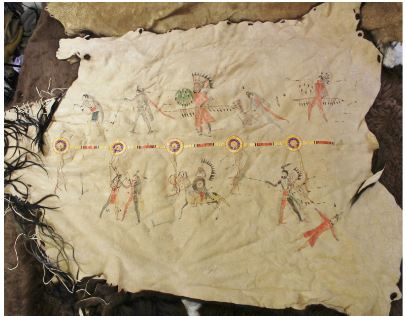
Mandan chief's painted and quilled buffalo robe