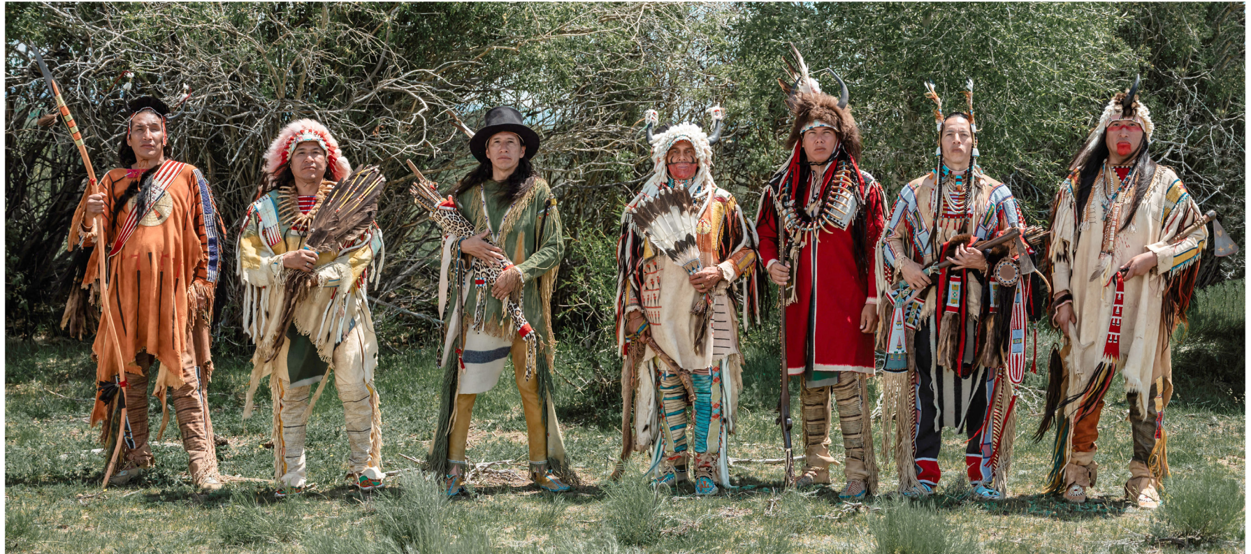
Assiniboine 1830s (Tim)