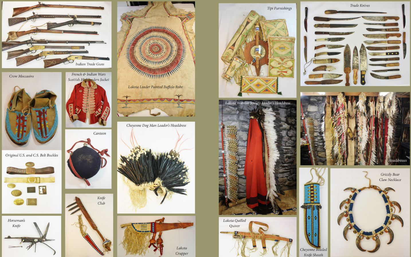
Small selection of the variety of items in the Bad Hand collection of over 1500 Plains Indians related items, an unparalleled interpretive opportunity.