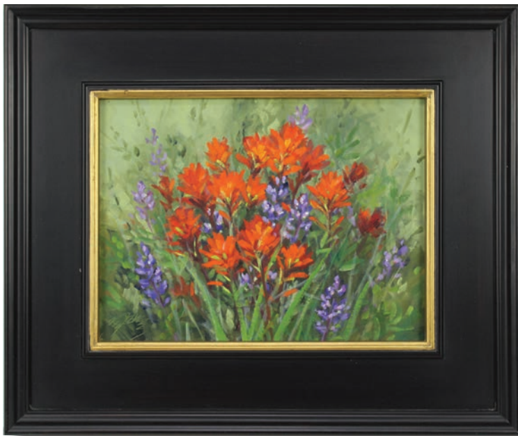
“INDIAN PAINTBRUSH & LUPINE” 15 in. x 18 in. Frame 9 in. x 12 in. Image Original Oil on Canvas Signed