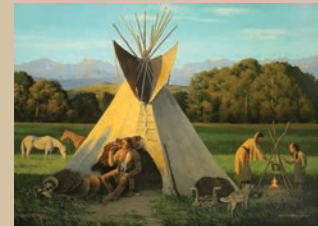
David Wright “Good Grass, Good Camp” Oil Painting $11,000