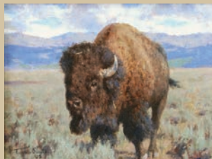
Tucker Smith “Bull Bison” Oil Painting $9,000