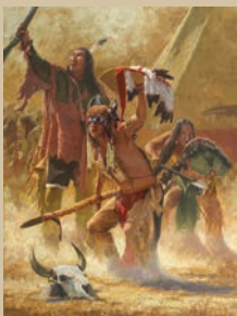
Jason Lee Tako “Buffalo Callers” Oil Painting $14,500

Four pieces of original artwork are being offered for sale during this event. The Museum of the Mountain Man will get a commission from each sale. See pages 14-17.