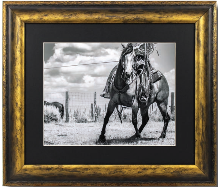
“A DAYS WORK” 19 in. x 22 in. Frame 11 in. x 14 in. Image Giclée Print on Luster Paper