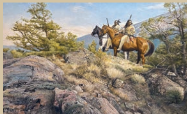
Kevin McDonald “Pursued” Oil Painting $6,500