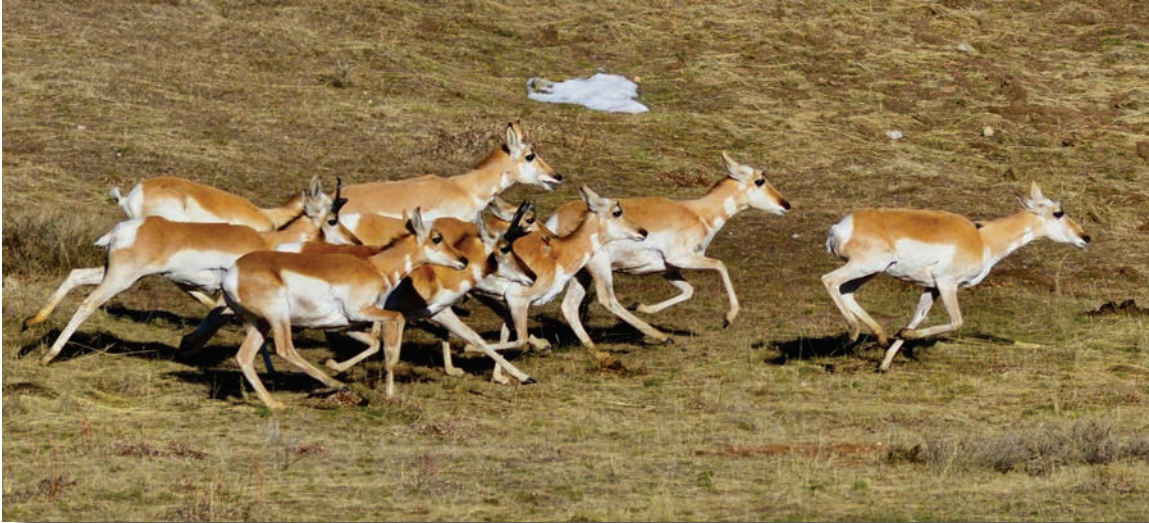
Lot no. 3 Rob Tolley