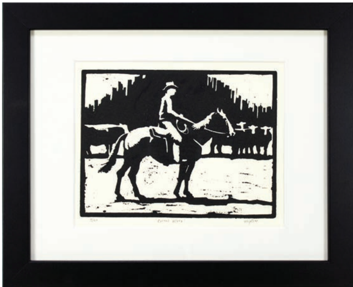
“CORRAL WORK” 13 in. x 16 in. Frame 7.5 in. x 9 in. Image Wood Block Print Signed, Limited 9 of 60